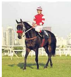
Gorylla in Brazil

Brazilian invader Gorylla (Brz) (New Colony), let go at 16-1, triumphed over his more heralded rivals to win the G1 Gran Premio Internacional Carlos Pellegrini at Hipodromo San Isidro yesterday in Buenos Aires, Argentina. The consistent six-year-old hadn't been out of the money in four starts this campaign, winning the G2 GP Antonio da Silva Prado Oct. 5 before finishing third in the G1 GP ABCPCC-Matias Machline Oct. 25. Both of those starts, contested at Sao Paulo's Cidade Jardim racecourse, came over today's 2400-meter distance. An objection against the winner by the runner-up, Lancettier (Arg) (Numerous), was not allowed by the stewards.