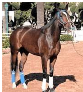
Hollywood Story

Hollywood Story (Wild Rush) provided a storybook ending to Hollywood Park's fall meeting, earning her maiden win with a authoritative victory in yesterday's