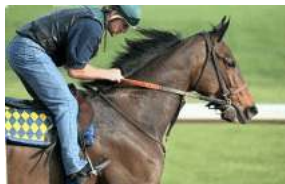
Atlantic Ocean

Atlantic Ocean (Stormy Atlantic), scratched from Saturday's GII Dahlia H. because of an unfavorable outside draw, will instead run in Saturday's GI La Brea S. at Santa Anita. The three-year-old filly, second behind Dahlia winner Katdogawn (GB) in the GII San Clemente H. in August, has been off since finishing fifth in the Aug. 24 GI Del Mar Oaks. A graded stakes winner on turf and dirt, Atlantic Ocean has not started on the main track since a ninth-place effort in the GI Kentucky Oaks.