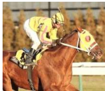
Shake You Down

Shake You Down (Montbrook) capped a highly successful 2003 campaign with a confident 2 1/4-length victory in yesterday's GIII Gravesend H. at Aqueduct. The five-year-old gelding had already won this year's GIII Bold Ruler H., GII True North Breeders' Cup H., GIII Smile Sprint H. and was a game third-place finisher after chasing a torrid pace in the GI Breeders' Cup