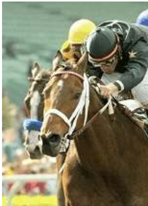
Buddy Gil