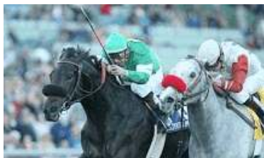
Southern Image (green silks) out-duels Marino Marini

Always prominent as Midas Eyes set the pace just in advance of recent import Marino Marini , Southern Image raced four wide around the far turn, loomed a