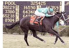
Volga