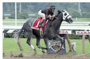
Island Fashion Horsephotos

Although he sired the magnificent European colt Dubai Millennium, Seeking the Gold has been a better sire of fillies than colts. It's somewhat paradoxical, then, to discover that he is turning out to be quite a sire of sires. Four of his sons--the Australian-based Secret