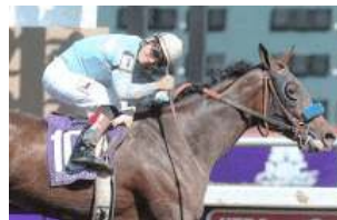
Sweet Catomine

Despite muck and mire, a slew of newly-turned sophomores were sent out for preparatory drills at Santa Anita this weekend in advance of their 2005 debuts.