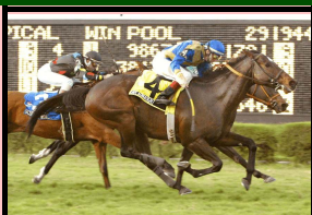
Dreadnaught-G2 McKnight H.

2 of BTSI's recent weanling sales at Keeneland have gone on to be GSWs, including DREADNAUGHT-G2.