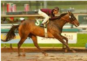
Areyou talkintome

Areyou talkintome (Smokester) had many obstacles to overcome in his quest for his first graded stakes victory, but he proved that no mountain is high enough as he dispensed of all opposition in Sunday's GIII El Conejo H. at Santa Anita Park. Facing graded stakes winners