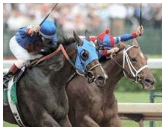
'Mayo' (outside) defeating Azeri