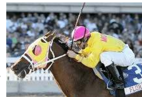
Shake You Down

Gulfstream last January. The chestnut gelding was off the board in three of his next four starts, but rebounded from a tired 10th-place finish in the Nov. 20 GI DeFrancis Dash with a three-length score over optional