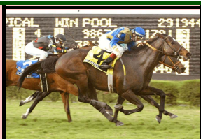
Dreadnaught-G2 McKnight H.

2 of BTSI's recent weanling sales at Keeneland have gone on to be GSWs, including DREADNAUGHT-G2 .