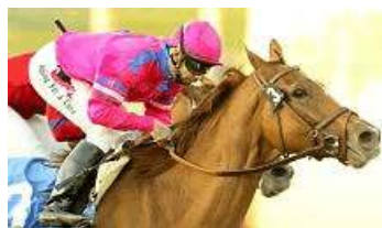
Theater R.N.

If he can fill the prescription for nine furlongs of turf, Bobby Frankel will be tough to beat in the GII San Gorgonio H. at Santa Anita this afternoon. The Frankel-trained Theater R.N. (Theatrical {Ire}) will try to run her