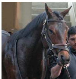
Badge of Silver

Unbeaten Commentator has won his five starts by a combined 42 1/4 lengths. The New York-bred gelding took three straight against fellow state-breds before jumping into open stakes company to win the Oct. 14 Perryville S. at Keeneland by seven lengths. The four-