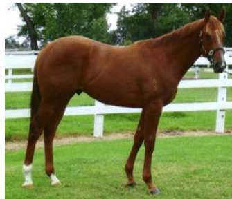
Giant's Causeway colt who went for A$480,000