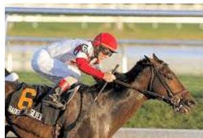
Badge of Silver