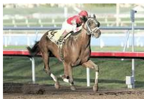
Saratoga County