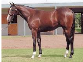
Lot 516 - Saturday's Topper www.magicmillions.com.au

ANOTHER DAY, ANOTHER DANEHILL After a bullish 2004 sale season culminated in a record-shattering Inglis Easter sale last April, it was perhaps inevitable that the next major sale would seem subdued by comparison. And until Saturday night, Magic Millions