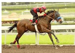
Sweet Catomine