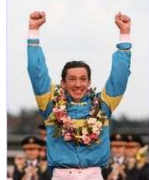
Frankie Dettori

DETTORI JOCKEY OF THE YEAR Frankie Dettori, fresh from a winning visit to Italian track Siracusa on Thursday, was awarded the Jockey of the Year accolade at the Jockeys' Association 15th annual awards ceremony, also known as the