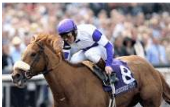
Breeders' Cup Juvenile winner Wilko

For the second consecutive year, Keeneland has the good fortune of offering the dam of a Breeders' Cup winner and Eclipse Award finalist. Last year's January sale received a boost two months earlier when Cajun Beat registered an upset victory in the 2003 Breeders' Cup Sprint. His dam, Beckys Shirt, was part of the catalogue and realized a final bid of $850,000 from BBA Ireland to top the sale. Crescent Hill Farm consigns hip 64 , the eight-year-old mare Native Roots (Ire) (Indian Ridge {Ire}), to this year's proceedings. The chestnut mare was just a maiden winner in 11 starts, but got off to a much more impressive start at stud, producing a colt by Awesome Again in 2002. That foal, now known as Wilko, placed three times in group competition overseas, but came to this country and upset some of the nation's top two-year-olds in last year's Breeders' Cup Juvenile. Native Roots was purchased for just $22,000 at last year's OBS Winter Mixed Sale carrying a foal by Talk Is Money. She sells on a May 9 cover to G1 Dubai World Cup winner Street Cry (Ire) (Machiavellian).