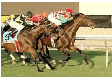
Union Place rolls home Equi-Photo

For a video replay of the race, click here .