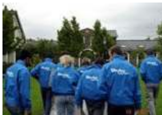
The Darley students

The Darley Flying Start program, a Thoroughbred industry management training program conceived by Sheikh Mohammed bin Rashid Al Maktoum, kicked off its inaugural semester in August 2003. As its third draft of students gets set to commence study in 2005, the endeavor continues to expand and become better-tuned to the needs of the students and the industry as a whole.