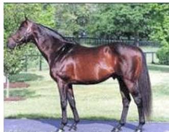
Seeking the Gold www.claibornefarm.com

One of the continuing fascinations of Thoroughbred breeding is its sheer unpredictability. For example, how can a stallion as successful as Caerleon sire 12