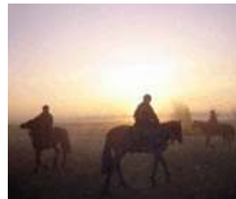
On The Gallops

Similar to the initial group, the students began their training in August at Kildangan Stud in Ireland. At the end of October 2004, they moved on to Dalham Stud in England before taking two weeks off for Christmas. They headed to Kentucky last week and will remain in the Blue Grass State for about seven months before taking a four-week summer break.