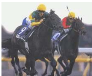
Zenno Rob Roy

Zenno Rob Roy (Jpn) (Sunday Silence), who ended his season with a string of three straight prestigious victories, was named the Japan Racing Association's Horse of the Year and champion older horse for 2004. The five-year-old began his streak with a win in the Tenno Sho in October and added the G1 Japan Cup in November before a record-setting victory in the Dec. 26 Arima Kinen. Japanese Derby winner King Kamehameha (Jpn)