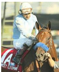
Sweet Catomine

Santa Anita's $100,000 GIII Santa Ysabel S. and $100,000 San Miguel S., both of which were cancelled last weekend because of torrential rain, have been rescheduled for Sunday and Monday, respectively. Expected juvenile filly champion Sweet Catomine (Storm Cat), who was scratched out of the Santa Ysabel even before racing was called off Sunday, will again be entered in the mile-and-a-sixteenth event, according to trainer Julio Canani. The San Miguel had drawn a small but solid field of five, including Seize the Day (Montbrook), who finished third to Declan's Moon in the GIII Hollywood Preview. Santa Anita is holding special holiday racing Monday, Martin Luther King, Jr. day.