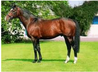
Sadler's Wells www.coolmore.com

The international auction for nominations to the stallions standing at Coolmore Stud's operations in the U.S., Ireland and Australia concluded Tuesday evening and raised a total of over $2.2 million to assist the International Red Cross in its work with the survivors of the tsunami disaster. The fund was increased to more than $3.5 million through a donation from an anonymous friend of Coolmore. The auction came to a close with a