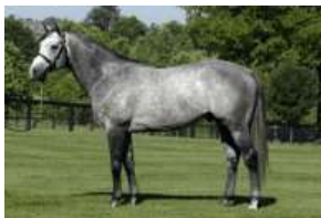
Sire of hip 1259, Mizzen Mast