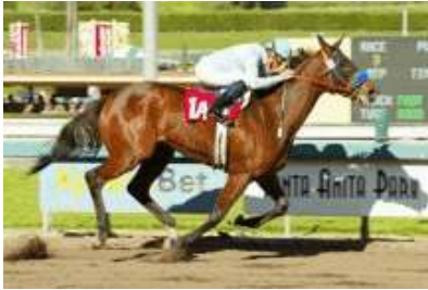
Sweet Catomine