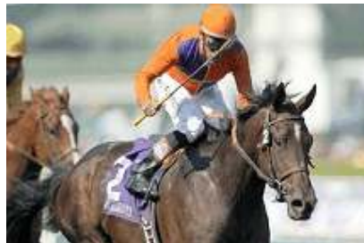
Action This Day