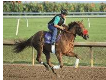
Sharp Lisa

Sweet Catomine might just be in a league unto herself, but Sharp Lisa (Dixieland Band) will look to bridge the gap as the heavy favorite in this afternoon's GII