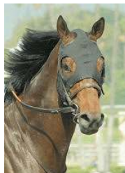
Roman Ruler

Trainer Bob Baffert has named the Feb. 13 GII San Vicente S. at Santa Anita as a possible spot for Roman Ruler (Fusaichi Pegasus), who underwent surgery to remove an undescended testicle after his fifth-place finish in the GI Breeders' Cup Juvenile S. The Fog City Stables colorbearer worked five furlongs Monday at Santa Anita, getting the distance in 1:00.40. "He went very nice," said Baffert. "I got him in a minute and three [fifths] and he galloped out in [one] 13 and change. He went off slowly but relaxed well. The San Vicente is possible." Baffert, who won the seven-furlong San Vicente two years ago with Kafwain, said that he has noticed a difference in Roman Ruler since the surgery. "He's more relaxed, because that affected him mentally," said Baffert. "His stride is a lot more fluid."