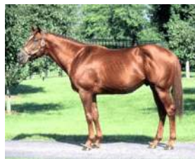
Horse Chestnut www.claibornefarm.com

Horse Chestnut also created quite a stir in winning his first start in the U.S, the Gill Broward H. over 1 1/16 miles on his dirt-track debut at the start of 2000. This impressive victory had raised realistic hopes that Horse Chestnut was going to prove just as brilliant in his new base as he had been in South Africa, but an injury in a workout ended his career just a couple of weeks later.