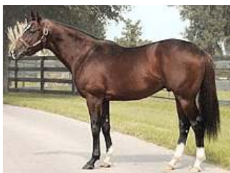
Three Wonders www.hiddenpointfarm.com