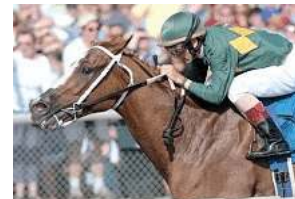
Quinton's Gold Rush

Grade II winner Quinton's Gold Rush (Wild Rush--Hollywood Gold, by Mr. Prospector) died Monday while undergoing surgery at San Luis Rey Equine Hospital in California, according to Blood-Horse . The four-year-old chestnut was having a tumor, located in his left nasal passage, biopsied when he died.