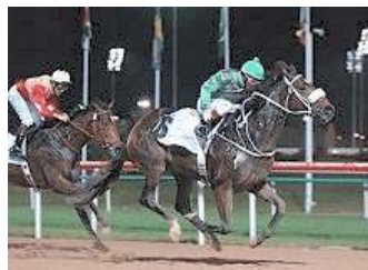
Grand Emporium