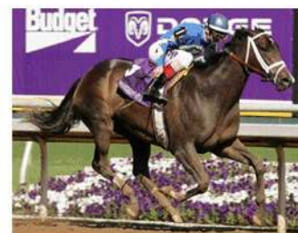
Breeders' Cup Distaff (G1) winner ASHADO

Taylor Made Sales Graduates and Breeders' Cup (G1) winners Ashado and Speightstown are Leading Eclipse Candidates