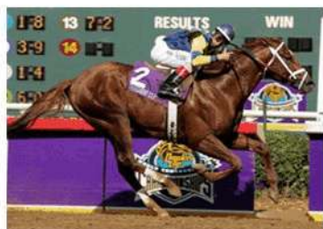
Breeders' Cup Sprint (G1) winner SPEIGHTSTOWN

Taylor Made Sales Graduates and Breeders' Cup (G1) winners Ashado and Speightstown are Leading Eclipse Candidates