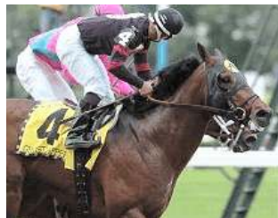
Ghostzapper

Between them, they averaged a winning margin of better than four lengths in 2004, but their final race of the season went right down to the wire. At the finish, it was Ghostzapper (Awesome Again) beating out Smarty Jones (Elusive Quality) for Horse of the Year honors, 174 votes to 95. In addition, his breeder, Adena Springs, took the Eclipse as top breeder, knocking off three-time champ Juddmonte Farms.