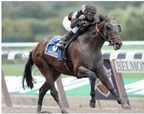
Ghostzapper

There were no surprises at the 34th annual Eclipse Awards dinner, held last night in Beverly Hills. While none of the winners was the unanimous choice in his/her division, the favorites in each category prevailed. Ghostzapper (Awesome Again), who earned 269 of a possible 274 votes as champion older male, outscored three-year-old Smarty Jones (Elusive Quality) on the Horse of the Year ballot as well, winning the title 174 to 95. Also receiving a vote for Horse of the Year were champion sophomore filly Ashado (Saint Ballado) and champion turf male Kitten's Joy (El Prado {Ire}), with three voters abstaining. But Sweet Catomine (Storm Cat) was the most dominant divisional winner, taking 273 votes to Runway Model's one. The two closest categories were for sprinter, where Speightstown (Gone West) beat out Pico Central (Brz), 157 to 101; and older mare, where three-time Eclipse champion Azeri (Jade Hunter) turned away Sightseek to pick up a fourth statuette, 179 to 91.