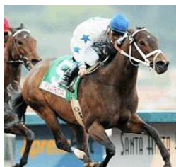
Mooji Moo