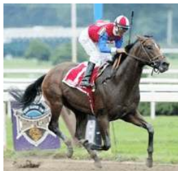
Midas Eyes

The third edition of the Sunshine Millions, a series of eight races scheduled to be contested at Gulfstream Park in Florida and Santa Anita Park in California Saturday, has attracted 93 entrants, including GI Forego H. hero Midas Eyes (Touch Gold). The five-year-old, who is currently the 3-1 morning-line choice for the Classic, is expected to face 11 others, including last year's GIII Holy Bull S. winner and GII Fountain of Youth S. runner-up Second of June (Louis Quatorze), who is listed at 6-1. Also slated to run in Gulfstream's nine-furlong event are Limehouse (Grand Slam), trained by Eclipse winner Todd Pletcher; and graded stakes winners Supah Blitz (Mecke) and Zakocity (Precocity). During the series' short history, no horse has won twice, but that could all change this year with Mooji Moo (Jeblar), who will try to repeat in the F/M Sprint at Gulfstream. A 37-1 longshot victress in last year's edition at Santa Anita, Mooji Moo will once again face Bear Fan (Pine Bluff), who finished third in 2004, but who has been installed the 6-5 choice to make amends. NBC Sports will televise all eight events beginning at 4:00 p.m. EST. Visit for complete entries www.gulfstreampark.com .