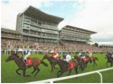
York Racecourse

This year's Royal Ascot meeting at York took shape on Tuesday with the announcement that two of the major contests will undergo slight changes to their distances. Officials at Ascot unveiled the running order for the festival June 14-18, with the news that the traditional mile events, including the G1 Queen Anne S., G1 St James's Palace S. and G1 Coronation S. will be shortened to seven furlongs and 205 yards. Among the other changes, the G1 Prince of Wales's S. will be run over 88 yards further than its