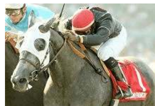
Island Fashion

Never worse than second in five previous tries at Santa Anita, last year's Santa Monica winner Island Fashion looks to rebound after two off-the-board efforts. The gray mare did not figure when 14th in the G1 Yasuda Kinen in Japan in June, but, freshened after her inter-continental adventure, she returned to take the Oct. 3 GII Lady's Secret Breeders' Cup H. She followed with a fifth in the Oct. 30 GI Breeders' Cup Dis-