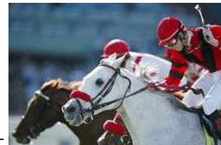
Star Over the Bay (inside)