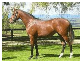
Hip 156 - Montjeu (Ire) filly

Champion Montjeu (Ire), off to a very promising start at stud, will be represented by 62 yearlings at the Premier Sale. The bay's first runners in the Northern Hemisphere include unbeaten Group 1 winner Motivator (GB). At last year's Premier Sale, his 51 youngsters averaged NZ$130,657. "The feedback from trainers in