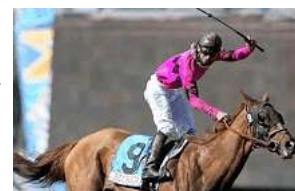
Sweet Lips