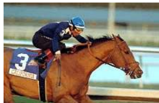
Musique Toujours