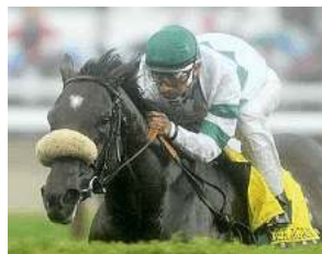
Wonder Again at Saratoga

‘WONDER’ AROUND AGAIN The Phillips’ millionaire Wonder Again (Silver Hawk) will remain in training this season, according to Daily Racing Form .