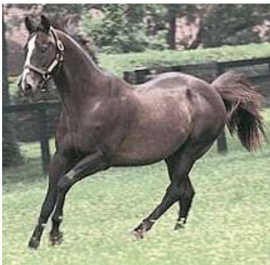
Devil's Bag (1981-2005)