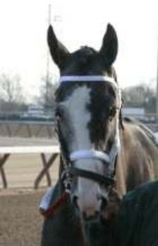
Rockport Harbor