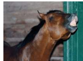
Saint Liam

It's True) cuts back in distance for the GII Hutcheson S., after finishing fifth behind Declan's Moon in the GI Hollywood Futurity Dec. 18. Defer (Danzig), winner of the GIII Laurel Futurity S., gets the services of Jerry Bailey for the Hutcheson. GII Demoiselle S. victress Sis City (Slew City Slew) heads a field of seven in the GII Davona Dale S. High Fly (Atticus) returns in the GIII Holy Bull S. after turning in an eye-opening nine-length tally in the Aventura S. Jan. 8. Off since finishing second to Medallist (Touch Gold) in the GIII Withers S. May 1, Forest Danger (Forestry) makes his long awaited return to the races versus that rival and five others in the GIII Deputy Minister H.