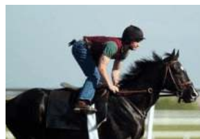
Roses in May

The racing world will turn its attention to Gulfstream Park Saturday, where the GI Donn H. headlines an action-packed 11-race card, which features six graded stakes races. The presence Roses in May (Devil His Due) and Saint Liam (Saint Ballado), who both finished second to Horse of the Year Ghostzapper last season, should make for a memorable Donn. Last year's GI Champagne S. winner Proud Accolade (Yes