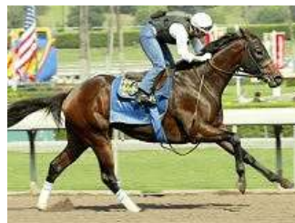
Roman Ruler

Multiple graded stakes winner Roman Ruler (Fusaichi Pegasus), prepping for Sunday's GII San Vicente S., worked six furlongs from the gate in company in