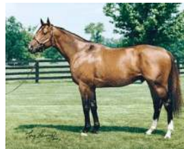
Albert the Great