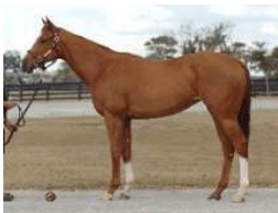
Hip 167