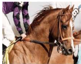
Delaware Township www.paduastables.com

Last year, Padua Stables' fledgling stallion operation received a boost when Yes It's True finished second on the freshman sire list. Yes It's True's leading runner was Proud Accolade, who won the GI Champagne S.