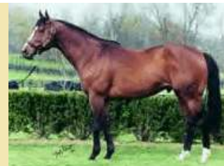
$10,000 Live Foal