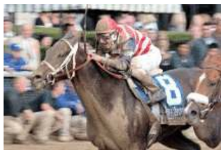
Runway Model