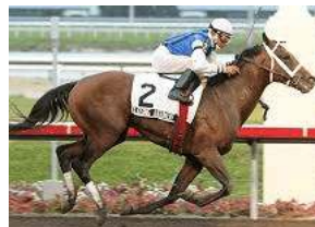
Closing Argument

Hip 197 received a timely update Saturday when her big brother, the three-year-old Closing Argument (Successful Appeal), upset heavily favored High Fly in the GIII Holy Bull S. at Gulfstream. A chestnut filly by Yes It's True, hip 197 is the second foal out of the unraced Mr. Greeley mare Mrs. Greeley. The eight-year-old's first foal, Closing Argument, had proven himself a talented two-year-old, winning at first asking at Saratoga before going on to annex the restricted NATC Futurity and place second in the $1-million Delta Jackpot. The Holy Bull was Closing Argument's first graded win. Hip 197 shared the bullet with five others Sunday when she sped through an eighth in :10 3/5.