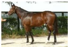
Hip 29