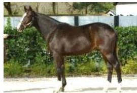
Hip 2

Tiznow (Cee's Tizzy) thrilled racing fans with brilliant back-to-back victories in the GI Breeders' Cup Classic, and now the stallion's first foals, two-year-olds of 2005, will help determine if Tiznow is as successful in the breeding shed. The lone OBSFEB offering by the