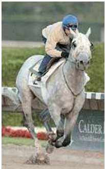
OBS Grad Silver Wagon

The first major juvenile auction of the year gets underway today with the Ocala Breeders' Sales Company's Selected Two-Year-Olds in Training Sale at Calder Race Course. Some 207 horses have been cataloged for the one-day event, slated to begin at noon. Though typically not a sale that features ultra-fashionable pedigrees, OBS February has consistently churned out top horses, including GISW Silver Wagon and GSW Chapel Royal two years ago and MGSW Runway Model last year. With a bustling backstretch and plenty of buyers in evidence, both consignors and sales officials are optimistic that this year's renewal will be successful. "I think we have an excellent group of horses here," said OBS Director of Sales Tom Ventura. "There's a lot of activity