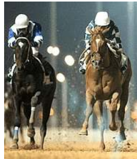
Jack Sullivan (right)

Jack Sullivan (Belong to Me), looking for his first stakes win, found it in the second round of the G3 Sheikh Maktoum Bin Rashid Al Maktoum Challenge at Nad Al Sheba yesterday. The chestnut had shown an affinity for the track when running second in the G3 UAE 2000 Guineas and fourth in the G2 UAE Derby last year. He finished off the board in three starts on the turf in England during the summer, but came to life at 20-1 to take a handicap on Lingfield's all-weather Nov. 20. Fourth in another Lingfield handicap Dec. 20, he shipped back to Dubai and opened 2005 with a third-place finish behind Grand Emporium (SAf) (National Assembly) in the first round of the Maktoum Challenge Jan. 20. Maktoum Challenge cont. p2