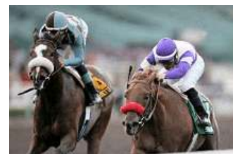
Sharp Lisa (right)