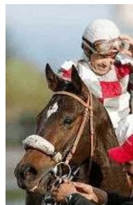
Ema Bovary Benoit