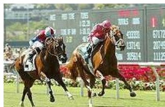
Sweet Win (rail) - Hip 509 Miss Vegas - Hip 505

F-T KY WINTER SALE STARTS TODAY The Fasig-Tipton Winter Mixed Sale will begin today at Newtown Paddocks in Lexington, Kentucky. A total of 547 head have been catalogued for the two-day auction. The opening day will feature yearlings and broodmares, while Monday will see broodmares, racing/broodmare prospects, horses of racing age, stallions and stallion prospects go through the ring. Among the broodmare prospects are graded stakes winners Sweet Win (King of Kings {Ire}) and Miss Vegas (Ire) (Efisio {GB}), who ran one-two in the GII San Clemente H. at Del Mar last summer. They will sell as hip 509 and hip 505, respectively. Selling as hip 348 is Cimarron Hills (Tactical Advantage), a winning four-year-old filly from the immediate family of champion sprinter Speightstown. Among the stallion prospects on offer is Saint Marden (Saint Ballado), slated as hip 546. The graded-stakes winner's half sister Sweet Lips captured the Sunshine Millions Distaff two weeks ago and ran second in yesterday's GII La Canada S. The catalogue is available online at www.fasigtipton.com .