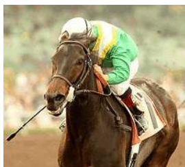
Star Parade