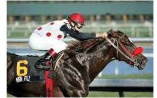
High Fly