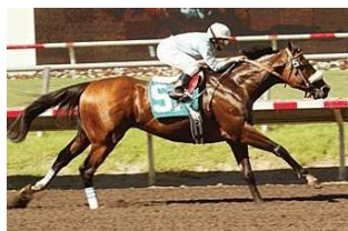
$10,000 Live Foal

Eurosilver (Unbridled's Song), 6f (g), 1:13.00, 1/4