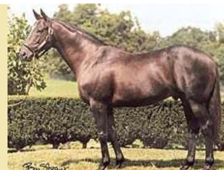
$15,000 - Live Foal