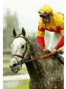
Fusaichi Rock Star Benoit