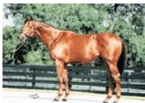
Lido Palace lambholmsouth.com

The second will run from Monday, Feb. 28 through Sunday, Mar. 6. All seasons for the six