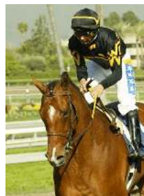
Bear Fan