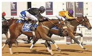
Littletown Bridge (12)

Forty Greeta will make her first start in Dubai this evening. The chestnut was perfect in four starts in her native Argentina, including the G1 Estrellas Juvenile Fillies last June, and was purchased privately by Sheikh Mohammed following that effort. Another Argentine, Queleden Candela --heroine of the G1 Estrellas Junior Sprint--was a close third in her local bow Feb. 3. The bay was beaten just 1 1/4 lengths by Littletown Bridge and Sun Sprinkles . The Irish-based Slip