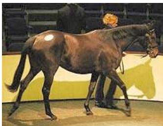
Top Forty - Hip 571 www.goffs.com

RAINBOW QUEST FILLY TOPS GOFFS As the evening drew to a close in County Kildare yesterday, it