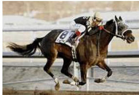
Cativa