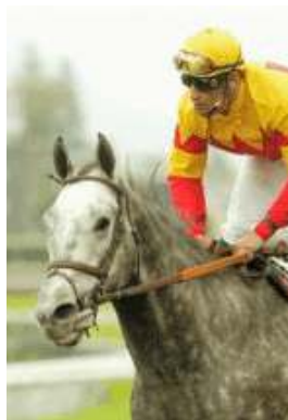
Fusaichi Rock Star Benoit