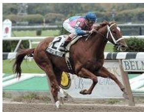
Galloping Grocer