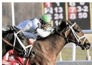
Coast Line tops Offlee Wild MJC photo

Coast Line has been a horse on fire since returning from a 15-month absence to beat up on Belmont