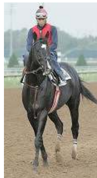
Roses in May