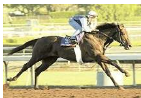
Siphonizer