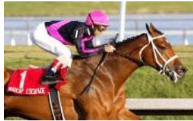
Madcap Escapade