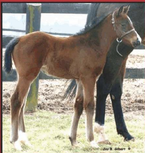
f. ex ANNIE'S HALO

First foals by HOLD THAT TIGER are fantastic.