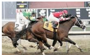
Saratoga County MJC