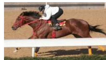
Afleet Alex