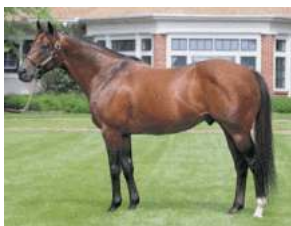
Kingmambo