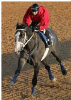
Rockport Harbor