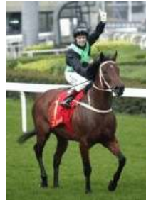
Silent Witness