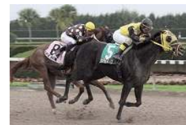
Supah Blitz