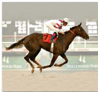
SPLENDID BLENDED shown winning the Grade 1 Hollywood Starlet

All horses in the TDN are bred in North America, unless otherwise indicated