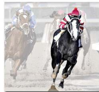
ROCKPORT HARBOR shown winning the Grade 2 Remsen Stakes

SIRE OF KENTUCKY DERBY (G1) CONTENDER ROCKPORT HARBOR "ROCKY" AND KENTUCKY OAKS (G1) CONTENDER SPLENDID BLENDED, UNBRIDLED'S SONG'S FIFTH GRADE 1 WINNER