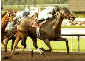
Miss Terrible