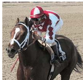
F-T Grad Forest Danger A Coglianese

No fewer than five graduates of the 2003 Calder Sale went on to capture Grade I events at three in 2004,