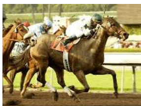
Miss Terrible

Turf has also played its part in Numerous' stallion career. Numerous Times gained his major victory on turf, and the stallion's impressive list of Grade 1 winners in Argentina includes several which have won at the top level on turf, such as Miss Terrible, Miss Loren and Mr Mat (Gran Premio Estrellas Classic).