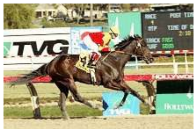
Last year's Fasig-Tipton topper, the $4.5 million Fusaichi Samurai

Fasig-Tipton will conduct its Selected Two-Year-Olds in Training Sale today at Calder Race Course in Miami, Florida, and the auction