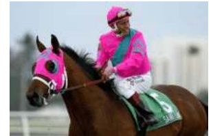
Saint Liam