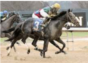
Greater Good