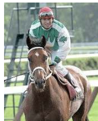
Afleet Alex