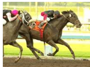
Rock Hard Ten, Imperialism in the Strub Benoit

Drawn just inside of the favorite is Rock Hard Ten (Kris S.), who seems to be improving with every start.