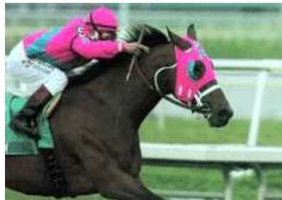
Saint Liam

Saint Liam (Saint Ballado) faces a field of 10 older horses as he seeks to become the first East Coast-based runner since Broad Brush in 1987 to win the