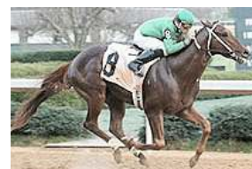
Razor