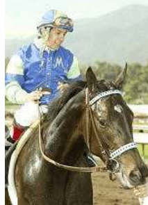
Declan's Moon