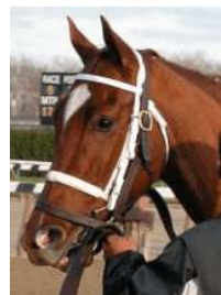
Galloping Grocer

Sleepy Hollow S. winner Galloping Grocer (A. P Jet), who was forced out of Saturday's GII Fountain of