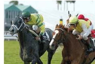
Honey Ryder (left)

Honey Ryder (Lasting Approval) caught Briviesca (GB) (Peintre Celebre) in the final stride to pick up her first graded-stakes win in the GIII The Very One H. at Gulfstream Park yesterday afternoon. The four-year-old filly had come close in the past, finishing third by 1 1/4 lengths in the 2004 GIII Herecomesthebride S. at Gulfstream, rallying to be a close-up third in the Dec. 18 GII La Prevoyante H. at Calder and most recently finishing fourth, beaten 1 1/2 lengths, in the Feb. 12 GIII Suwanee River H. The final time for the race was, for a short time, a course record 2:11.71, more than a full second faster than the mark set by Host in the Jan. 30 GIII Mac Diarmida H., but a tick slower than Prince Arch was clocked an hour later. The Very One H. cont. p2