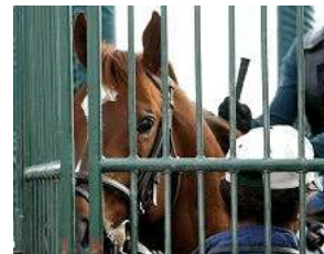
High Fly