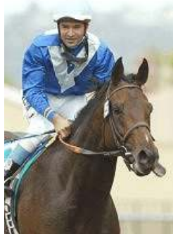
Musical Chimes