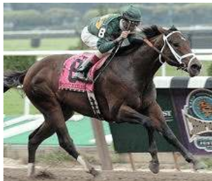
Proud Accolade

G1 Champagne S. winner Proud Accolade (Yes It's True), early favorite for Saturday's GII Louisiana Derby at Fair Grounds, spiked a fever Saturday and has been knocked out of contention for the classic prep. "It's obviously bad timing," said trainer Todd Pletcher. "We'll just try to get him back right." Pletcher still has Vicarage (Vicar) on track for the race, and with the defection of Proud Accolade, Johnny Velazquez will get the call on the colt. "He's been training well," said Pletcher.