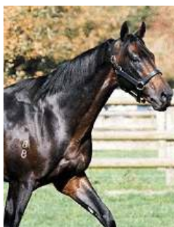
Don Eduardo NZ T'bred Marketing