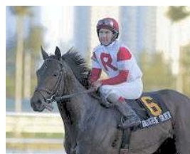
Badge of Silver