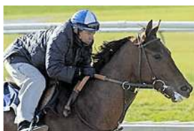
High Limit