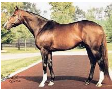
Forestry - 1st foal from Shared Interest