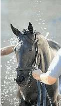
Declan's Moon