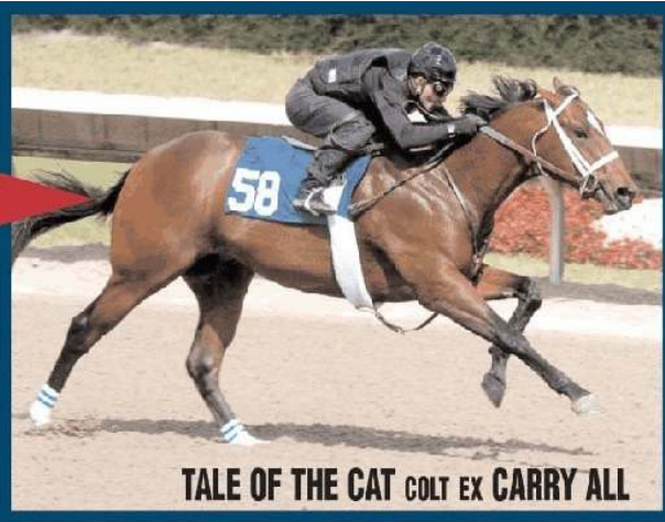
TALE OF THE CAT COLT EX CARRY ALL