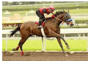
Sweet Catomine