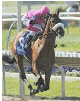
High Limit

High Limit (Maria's Mon), who dominated Delaware Park competition in two juvenile starts, took his game to the next level with a wire-to-wire win yesterday's GII Louisiana Derby at Fair Grounds. Sent off the 5-2 favorite in his first start since October, the bay colt went right to the lead and set moderate fractions of :23.56, :47.36 and 1:11.85. He sailed clear into the straight and wasn't threatened to the wire despite jumping tire tracks at the sixteenth pole and stopped the clock in 1:42.74 for the 1 1/16 miles, just missing the stakes record. "He seems to run