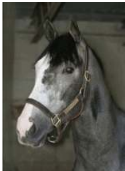
Rockport Harbor