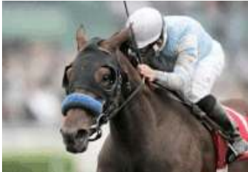
Sweet Catomine