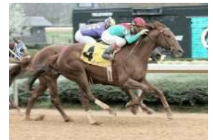
Added Edge

Canada's two-year-old juvenile champ in 2002, Added Edge (Smart Strike) was the consummate professional yesterday at Oaklawn Park, rallying from a stalking position to capture the GIII Razorback Breeders' Cup H. The five-year-old was sent off the second choice behind even-money Purge (Pulpit), but got the jump on that foe at the quarter pole and left him toiling down the lane. Added Edge collared the pacesetting Mauk Four (Boston Harbor) inside the final panel and got up in the waning strides. Purge faded to finish last of 10. Click for the brisnet.com chart . Razorback H. cont. p3