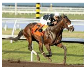
Sun King