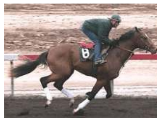
Hip 8 J Firios