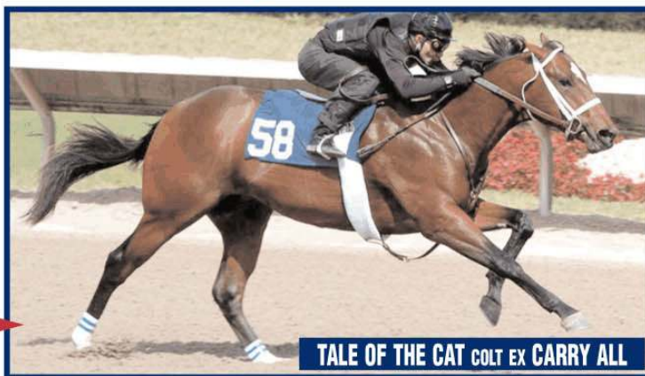
TALE OF THE CAT COLT EX CARRY ALL

THE WORLD RECORD-PRICED BREEZE-UP HORSE AT CALDER