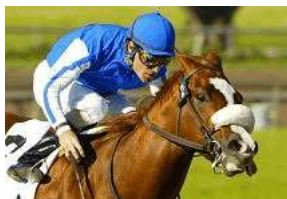
Spanish Chestnut