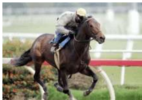
Don't Get Mad