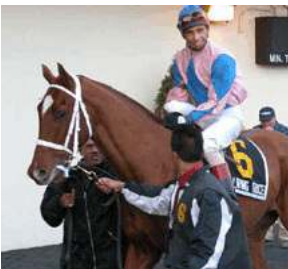
Galloping Grocer