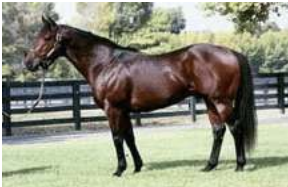
Lord Carson