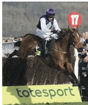
Kicking King

HE CAN KICK IT Kicking King (Ire) (Old Vic {GB}) allayed any fears about his ability to stay the 3 5/16-mile trip to land yesterday's £350,000 G1 totesport Cheltenham Gold Cup on the final day of the Prestbury Park track's four-day jumps extravaganza.