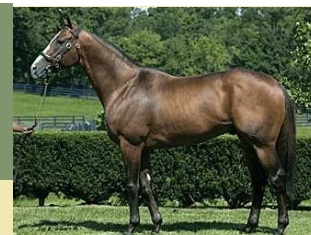
$17,500 Live Foal

Florida Derby-G1 • Blue Grass S.-G1 • Donn H.-G1