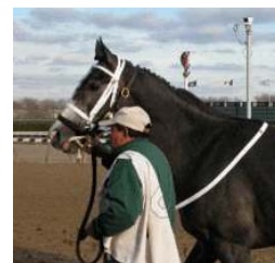
Rockport Harbor