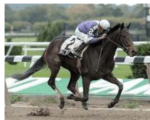
Toll Taker