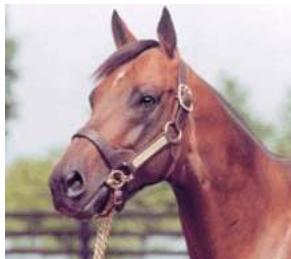
Awesome Again www.adenastallions.com

ADENA JUVENILE SALE TODAY The Adena Springs Two-Year-Olds in Training Sale, conducted by the Ocala Breeders' Sales Company, begins tonight at 6 p.m. at Adena Springs South in Williston, Florida. A total of 121 juveniles have been catalogued for the auction and represent Adena stallions such as Breeders' Cup Classic winners Alphabet Soup and Awesome Again, as well as El Prado (Ire), Gold Case, Golden Missile, Running Stag and Touch Gold. Other