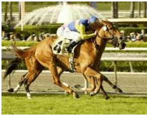
Megahertz