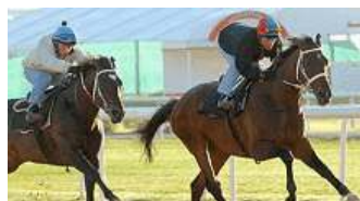
Yard-Arm (right) & Greys Inn