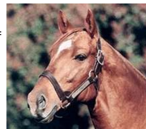
Golden Missile