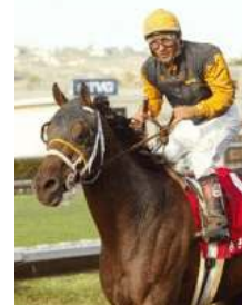
Choctaw Nation