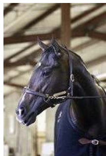
'04 OBS grad Proud Accolade

The Ocala Breeders' Sales Company hopes to continue the momentum of its February sale as it prepares to kick off the first of two selected sessions of the