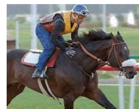
Pico Central