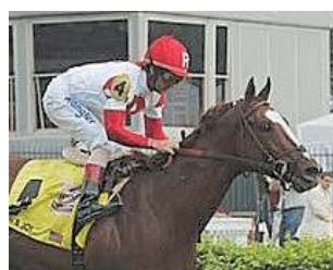
Kitten's Joy