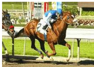
Spanish Chestnut