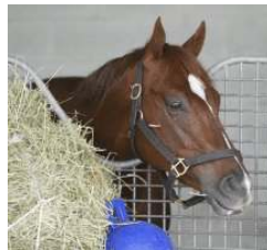
High Fly