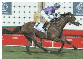
Phoenix Reach

Making his 11th career start and racing over his 10th different racing surface, Phoenix Reach (Ire) (Alhaarth {Ire}) overcame a slow pace, rallying from the back of the pack to notch yesterday's G1 Dubai Sheema Classic. The winner of the G1 Canadian International S. in North America at three, he was making his first start since taking the G1 Hong Kong Vase Dec. 12.