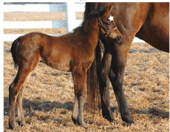
Filly out of MERIT WINGS - MULTIPLE NY SW, from the family of GOLDEN TRAIL Bred by PHILLIPS RACING PARTNERSHIP