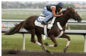
Noble Causeway

Noble Causeway (Giant's Causeway), an impressive Gulfstream allowance winner Mar. 5 ( video replay ), worked five furlongs in 1:01 at Palm Meadows yesterday in preparation for next Saturday's GI Florida Derby. "He looked good, didn't he?" said trainer Nick Zito shortly after the drill. A $1.15-million KEESEP yearling purchase, Noble Causeway began his three-year-old campaign