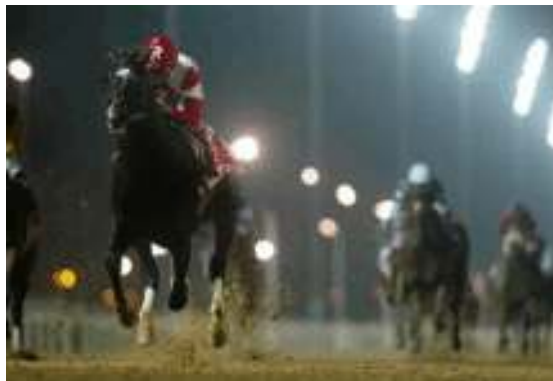
Roses In May dashes home in the World Cup