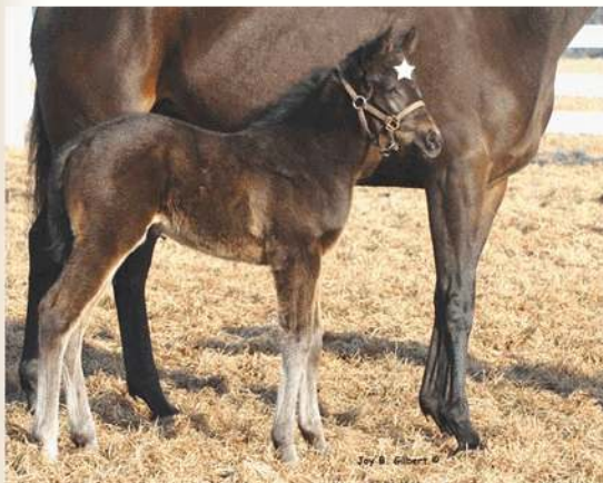
Filly out of ELLIE'S MOMENT - MULTIPLE STAKES WINNER Bred by PHILLIPS RACING PARTNERSHIP