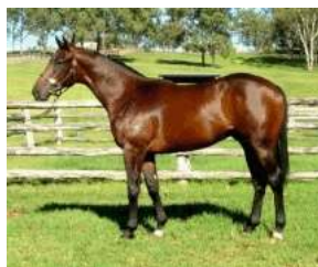
Lot 451 www.inglis.com.au

Lot 451 is expected to be among the sale-toppers. The dashing bay colt is out of Dora Maar (Aus) (Royal Academy), herself a half sister to international Group 1