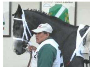
Rockport Harbor