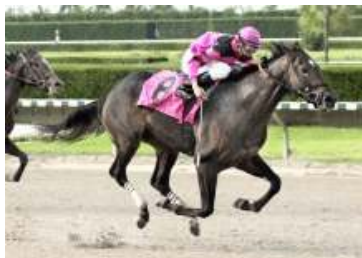
B.B. Best