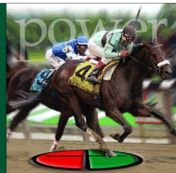
BIRDSTONE defeating Kentucky Derby and Preakness winner SMARTY JONES in the Belmont S.-G1

Power. Passion. Performance. 859-293-2676