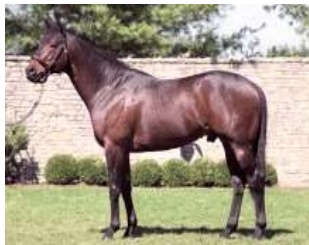
Honour and Glory

Unfortunately, by the time this 2002 crop reached the yearling sales, Honour and Glory's second and third crops had failed to replicate the success of that first crop, which also contained Name Value (G1 Teio Sho in Japan), Put It Back (GII Riva Ridge S.), Discreet Hero (GIII Round Table S.) and a handful of other stakes winners.