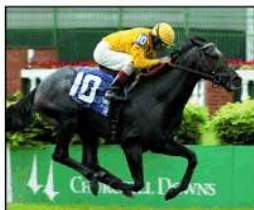
Woodford Reserve-G1 STROLL