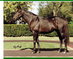
By Roberto, out of Andover Way, by His Majesty

Now the Second Leading North American Sire of 2005 , he's the sire of eight Grade I winners and seven millionaires in 2003 and 2004.