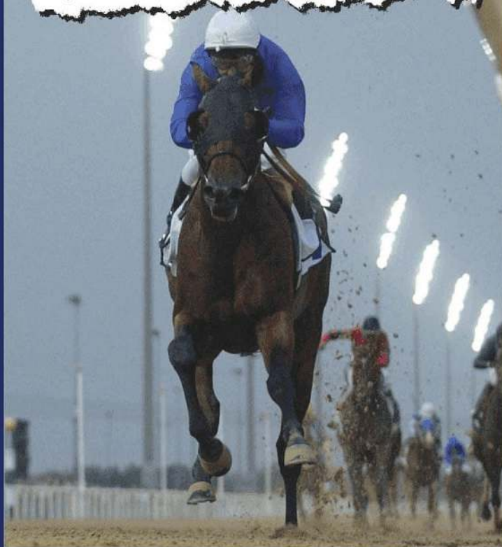
Blues And Royals wins the $2million UAE Derby-Gr.2 by 12L.

...Making his first start of the year, first start on dirt, and stakes debut, Blues and Royals turned in a brilliant performance, kicking away from a solid field. DRF.com