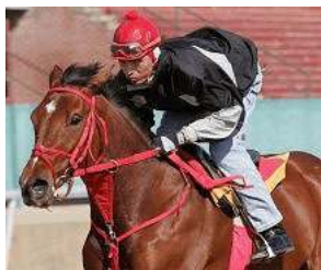
Afleet Alex

Afleet Alex (Northern Afleet), who came out of his sixth-place finish as the 3-5 choice in the Mar. 19 GII Rebel S. with a lung infection, scoped clean on Monday, according to Daily Racing Form .