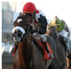
High Fly