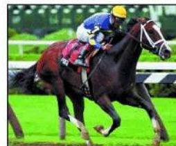
Jim Dandy-G2 PURGE