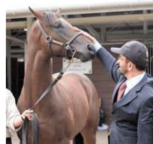
Lot 149 and Mohammed bin Khalifa al Maktoum