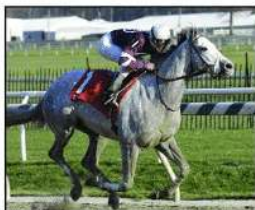
Wood Memorial-G1 TAPIT

Tapit (G1) Stroll (G1) Purge (G2) Pit Fighter (G3) Lydgate (G3)