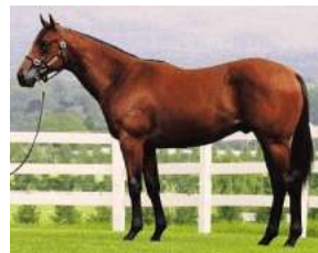
Lot 224