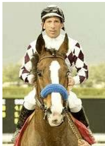
Hasty Kris

Eight-year-old Hasty Kris is in the best form of his life. The veteran gelding opened the year with a four-length score versus optional claimers over this track and trip Jan. 20 and made it two in a row in the Feb. 26 GII San Carlos H., beating Harvard Avenue by a half length, with Perfect Moon third. He has been first or second in 12 of his 17 Santa Anita starts. Saint Afleet has also excelled in Arcadia, winning twice in three tries. The lightly raced four-year-old has won five of his nine lifetime starts, including his latest, the Jan. 23 GII Palos Verdes H. "I worked him a couple days ago," said