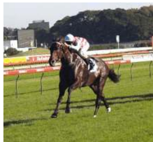
Grand Armee eightmonkeysmedia

Margins: 2HF, 1 1/4. Odds: 4-5, 40-1, 17-1. MG1SW Grand Armee gave a superb performance on the Australian Jockey Club's final Easter Carnival fixture to cement his status as a weight-for-age star.