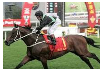
Silent Witness